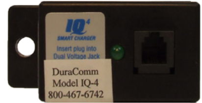
Weight - 1.1 oz 0.75" H x 1.25" W x 2.75" D